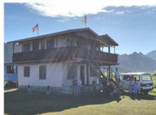
Fiji - Alliance Churches