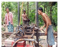
Bali - Living Water Wells