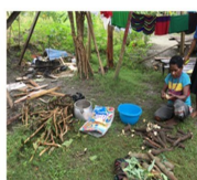
Papua - Bible College Students