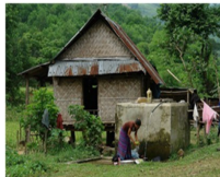
Vietnam - Bru Minority