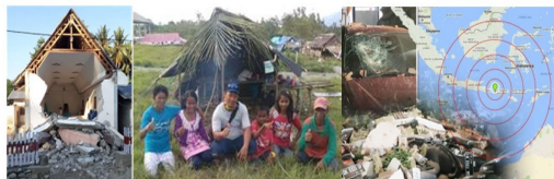
Disaster Relief—Sulawesi, Lombok